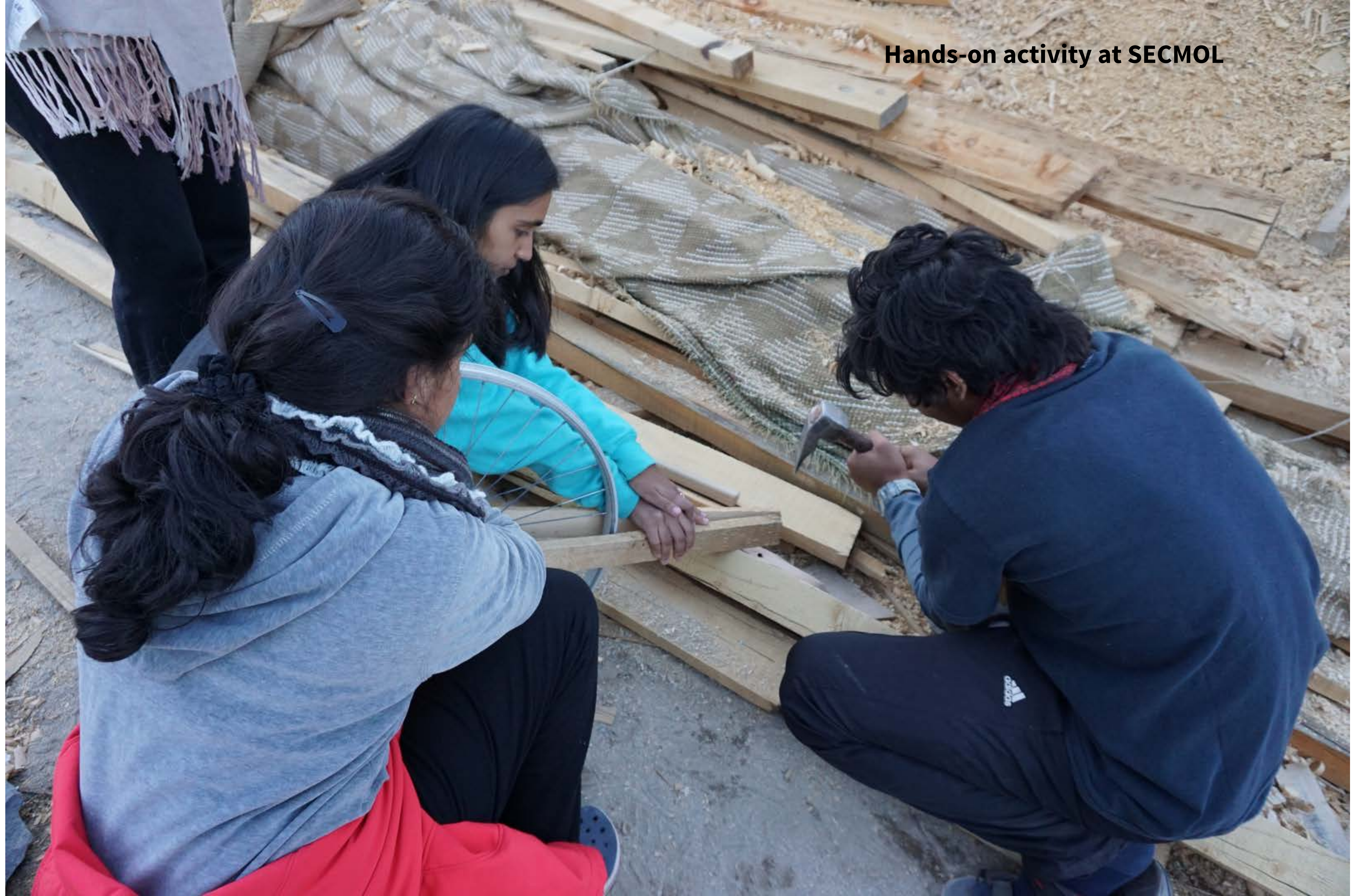
Hands-on activity at SECMOL