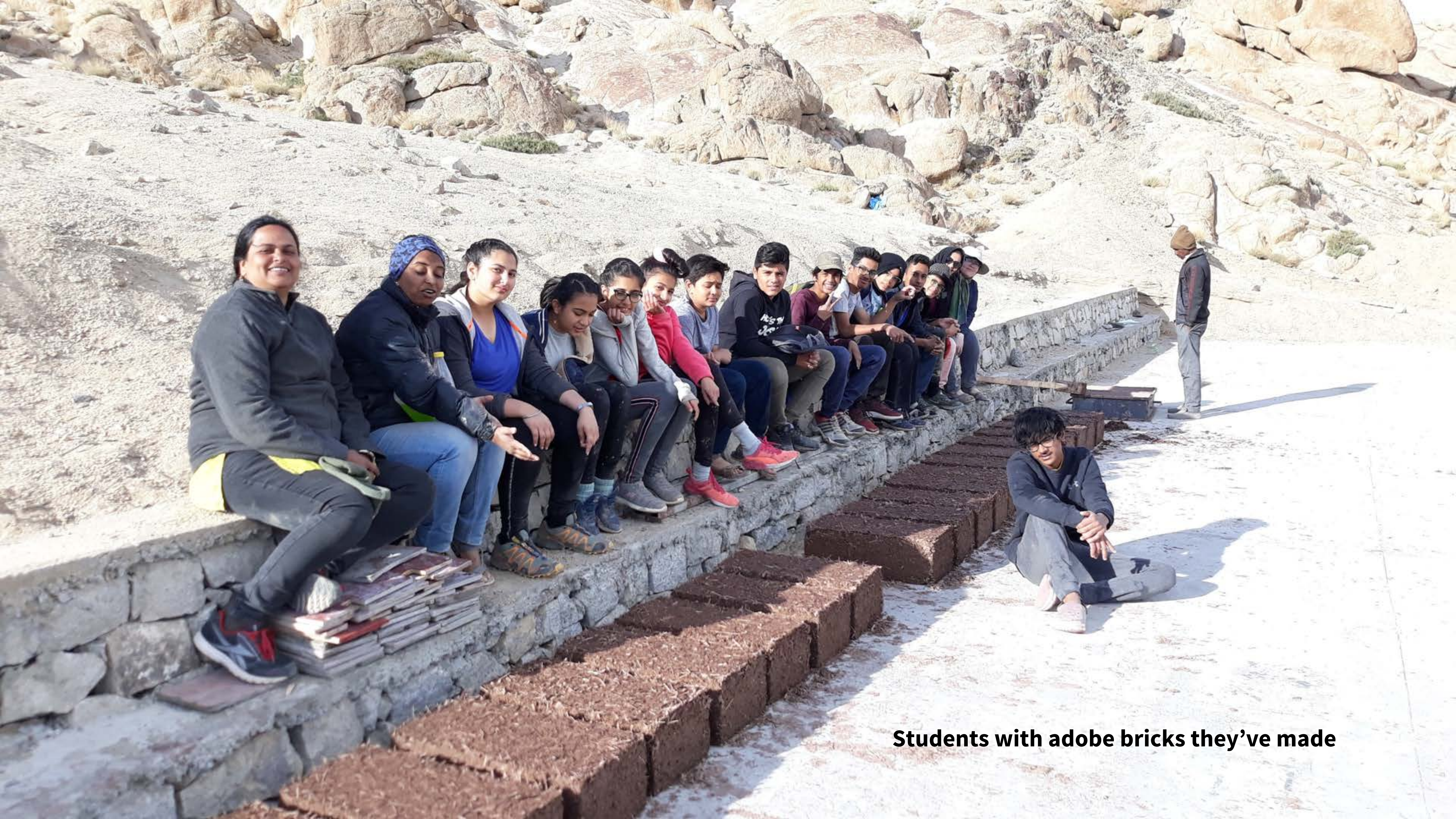
Students with adobe bricks they've made