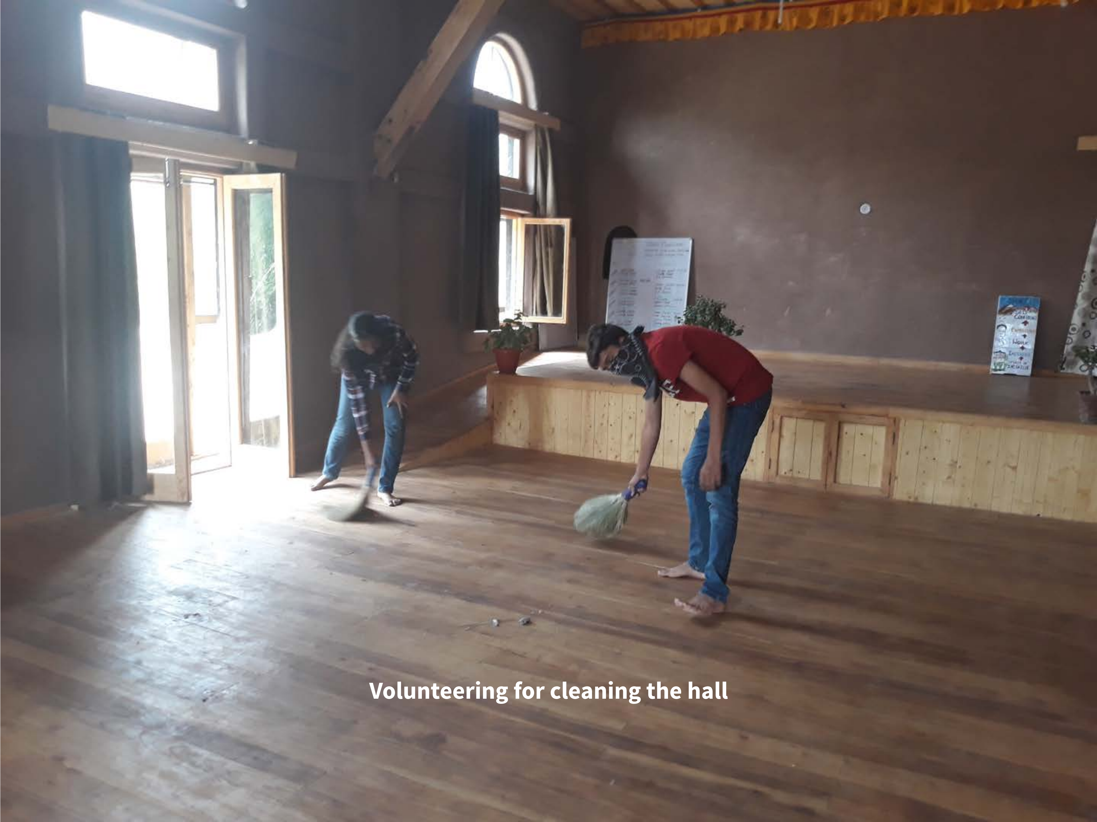
Volunteering for cleaning the hall