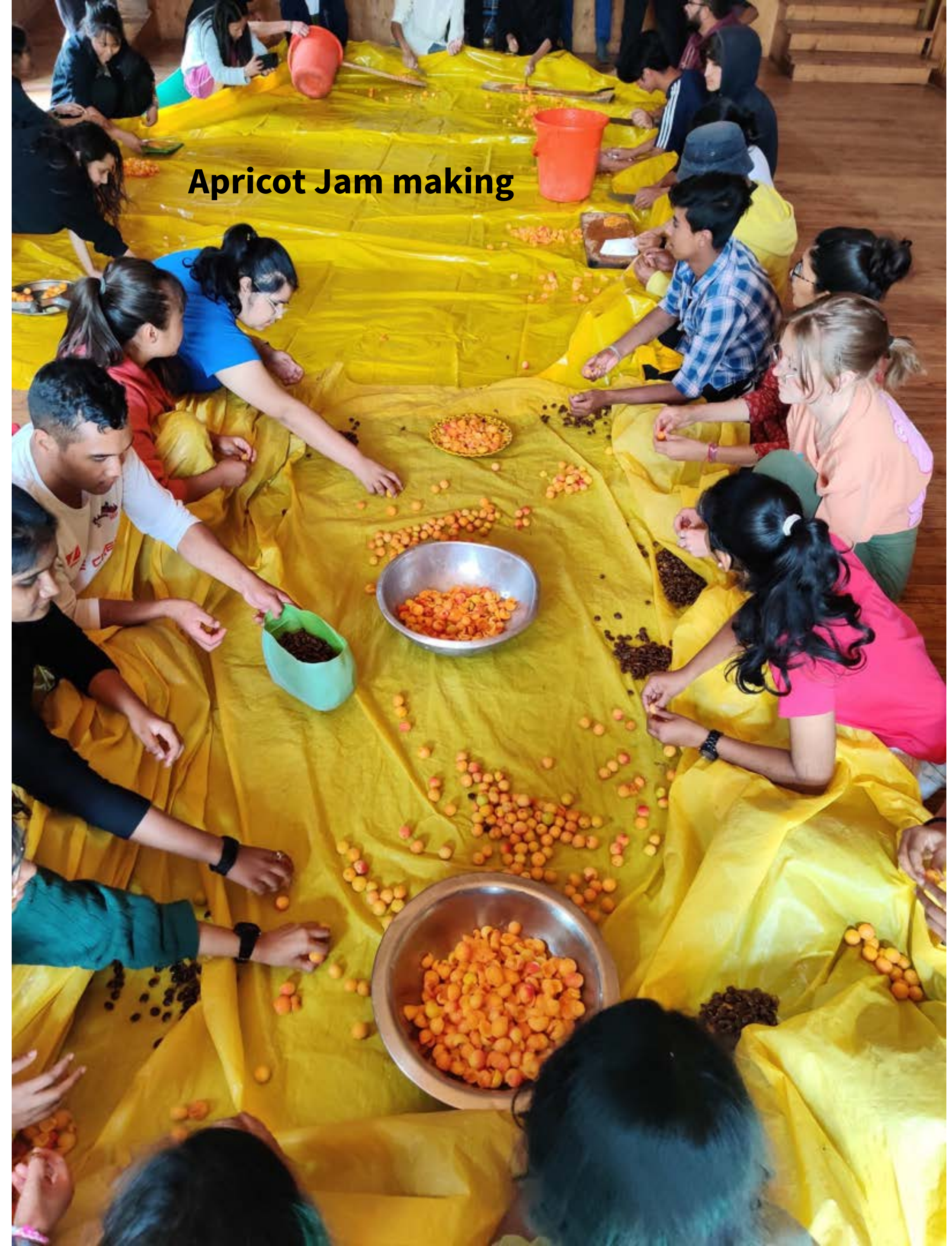
Apricot Jam making