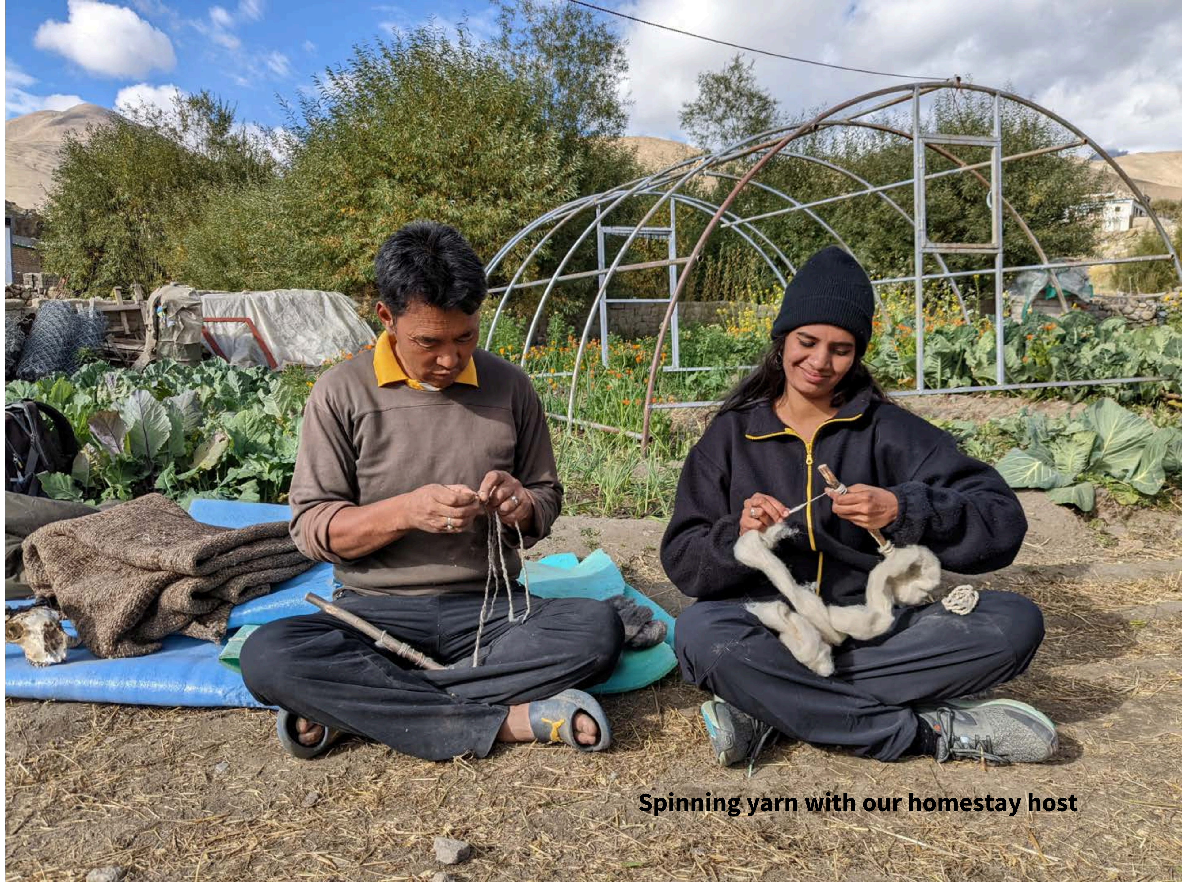
Spinning yarn with our homestay host