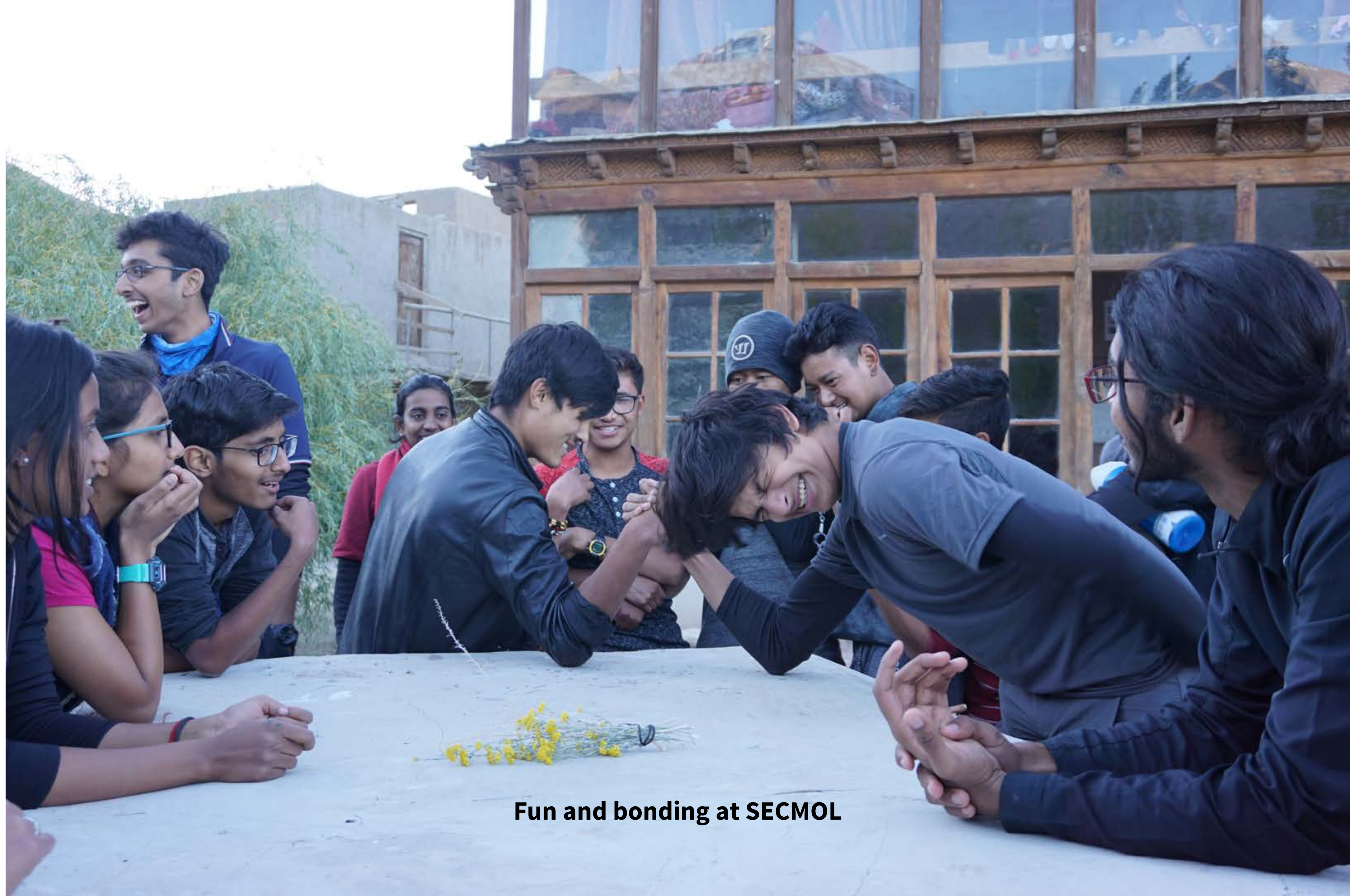
Fun and bonding at SECMOL