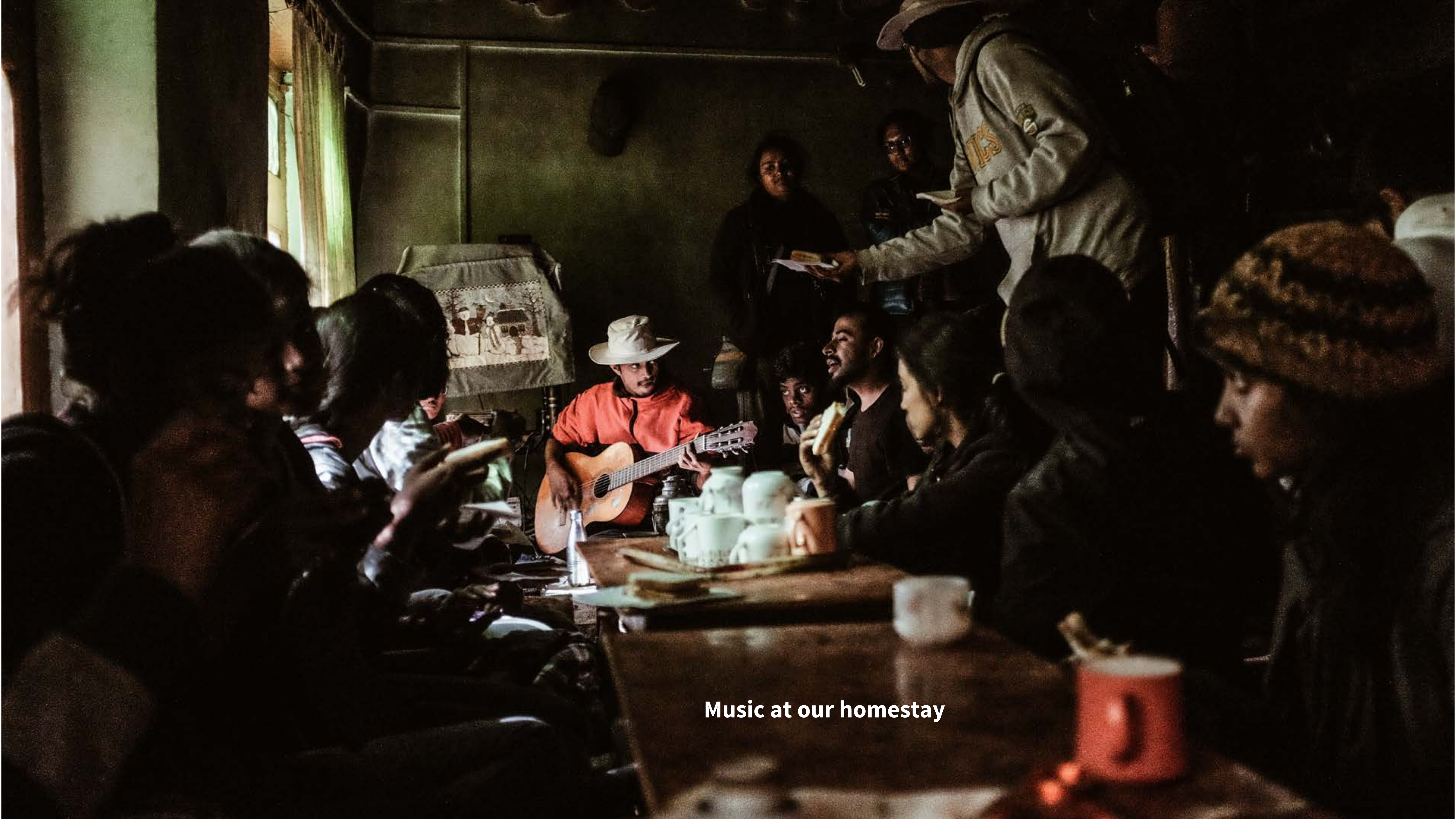
Music at our homestay