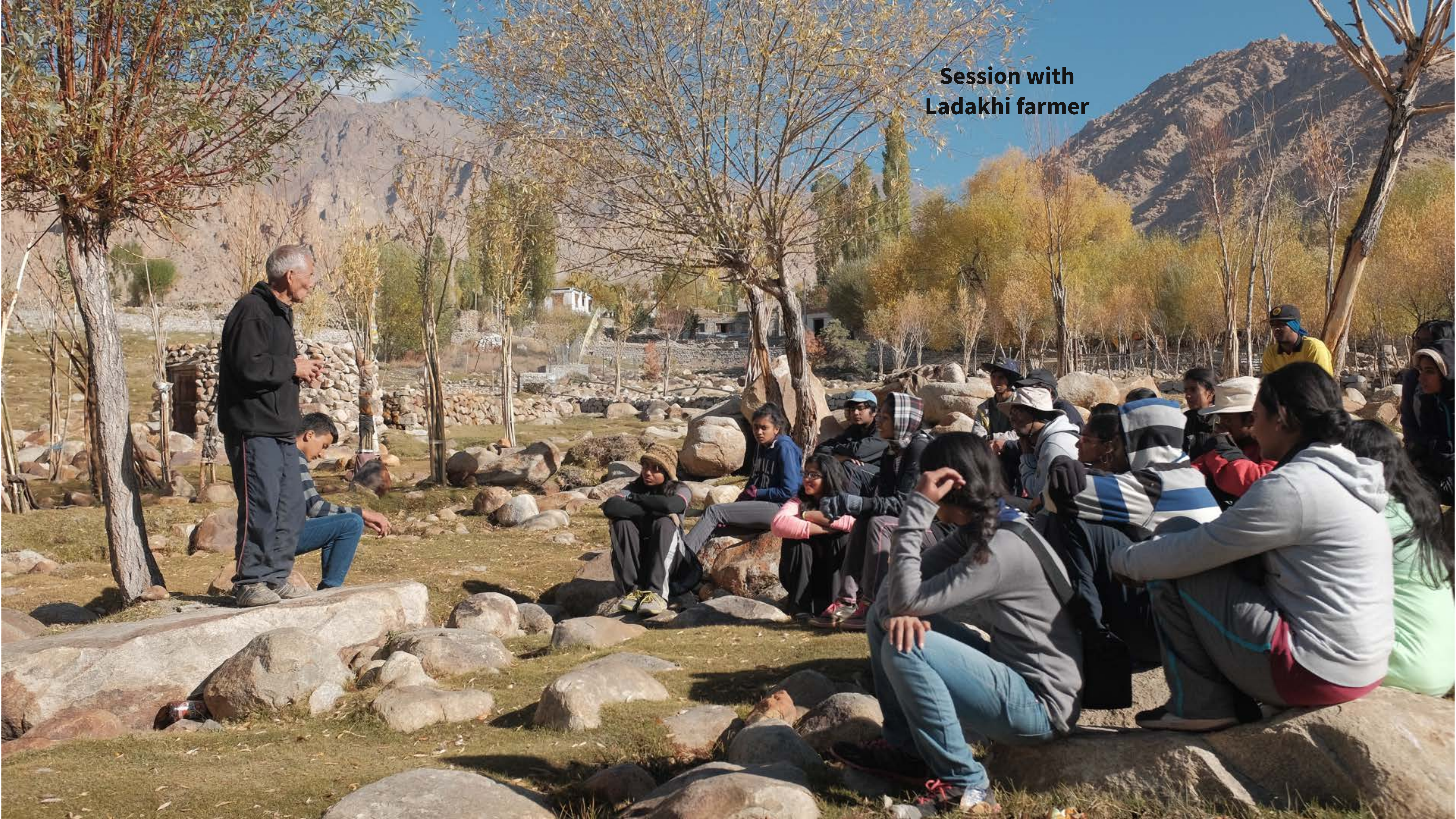
Session with Ladakhi farmer